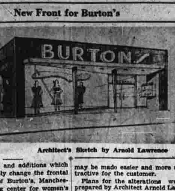
Architect's Sketch by Arnold Lawrence

New Front for Burton's Alterations and additions which will completely change the front appearance of Burton's, Manchester's shopping center for women's wear, started today. The present show windows and entrance will be completely remodeled as shown in the accompanying drawing, affording a modernized merchandise display and increased store area.