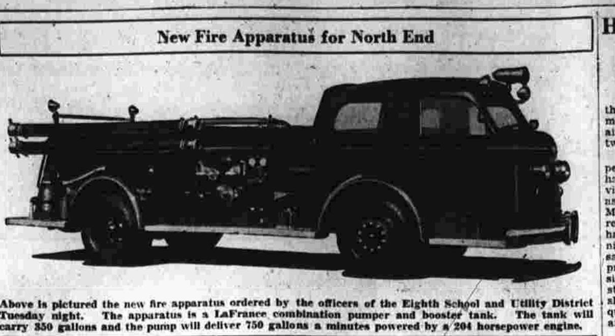
Above is pictured the new fire apparatus ordered by the officers of the Eighth School and Utility District Tuesday night. The apparatus is a LaFrance combination pumper and booster tank. The tank will carry 350 gallons and the pump will deliver 750 gallons a minute powered by a 204 horsepower engine.